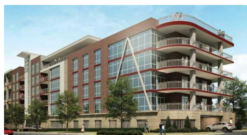
WestGate Condo Tuscaloosa, AL