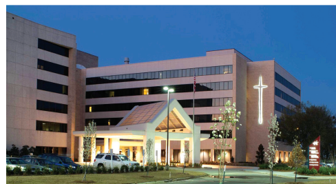
St. Dominic's Jackson, MS