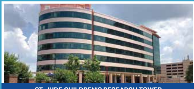
ST. JUDE CHILDREN'S RESEARCH TOWER