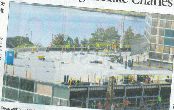
Crews work on the roof and façade of the Capital One Tower in downtown Lake Charles on Wednesday.

So far, Hertz has received $57 million from its insurance company, reflecting the building's